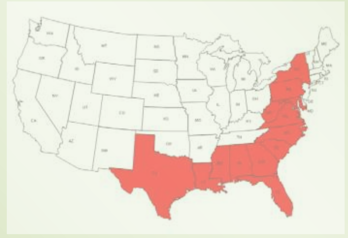
... Distribution of Ophiomyia kwansonis in the United States.